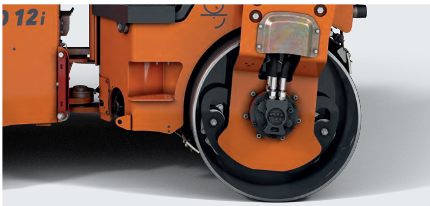
Elevated side plates provide plenty of side clearance when working alongside kerb edges.