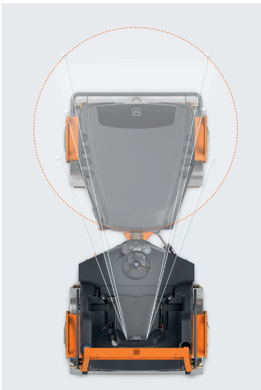
Clear view of the drum edges - thanks to the wasp waist!

The seat on the operator's platform can be moved sideways right up to the edge on the larger models. The drivers therefore have optimum conditions for a view of the drum edge.