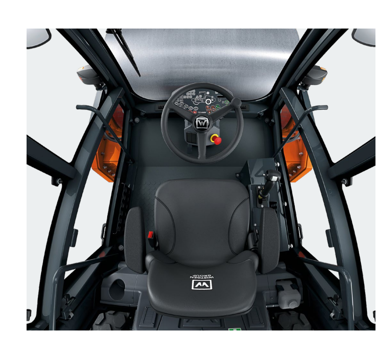
The HC series compactors are available with an open platform or a roomy cabin. The open platform with handrail features a glass-fibre-reinforced plastic roof that protects the operator from sun and rain.

The clever design of the air duct facilitates effective engine cooling without heating up the operator's platform, even at an ambient temperature of up to 52 °C.