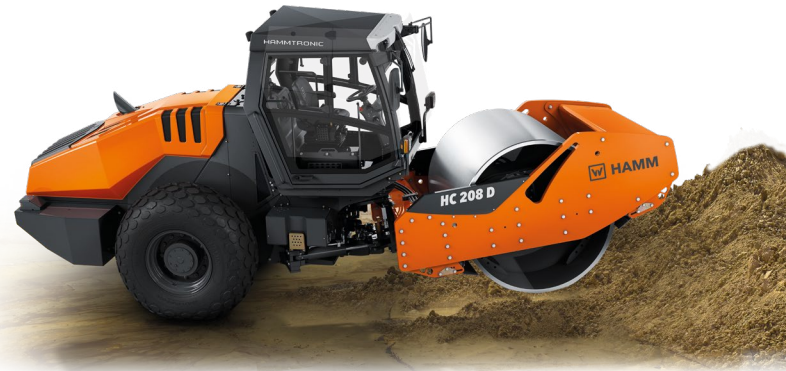
The compactors boast excellent traction even on rough terrain and have a large ground clearance.

The power train concept provides great climbing ability. For compaction on steep terrain, the compactors are ideal. They easily master slopes of up to 54%, and the rear axle with limited slip prevents wheelspin.