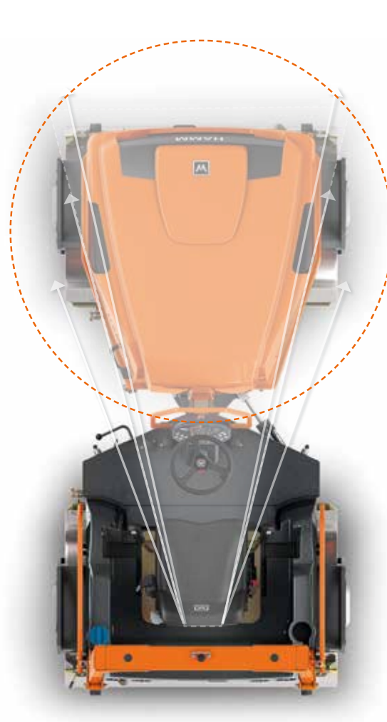
Clear view of the drum edges - thanks to the wasp waist!