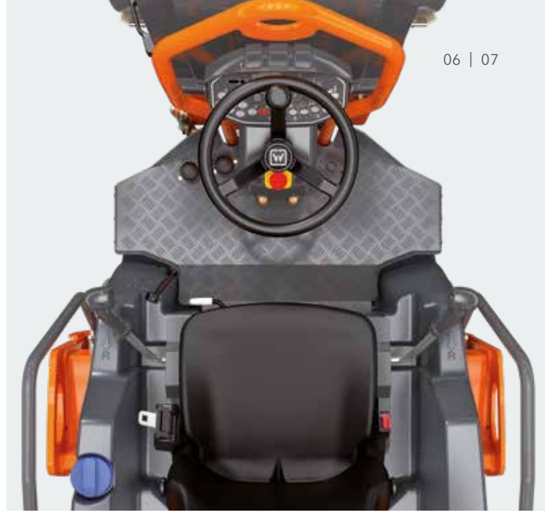
The operator's platform offers a lot of room - even for long legs.