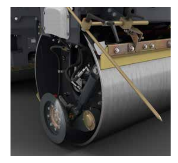
For the edge pressing and cutting device, there is a separately activated sprinkling system. It can be activated by the driver via a switch.

The large, self-cleaning water filter can be checked in seconds because it is located directly behind the fuel filler cap. The central water tank outlet is located at the lowest point of the machine, beneath the driver's seat. This position allows for complete draining. One single manual operation is all it takes to completely drain the water tank in the rear vehicle.