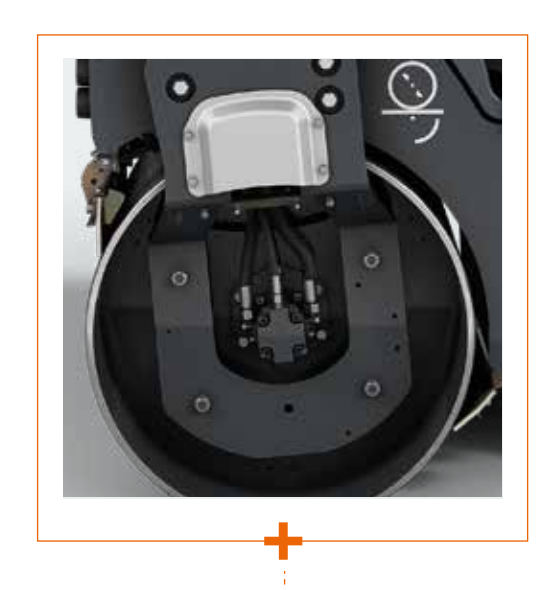
Elevated side plates provide plenty of side clearance when working alongside kerb edges.

The HD CompactLine also impresses when it comes to compaction power: For dynamic compaction with vibration, it achieves considerably higher centrifugal forces than other models in this market segment. In addition, all models have a high static linear load.