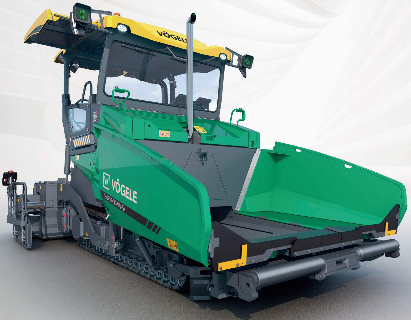
Tracked paver SUPER 2100-5(i) Highway Class